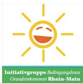
Initiative Group Unconditional Basic Income Rhein-Main, Germany