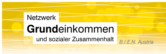
Network Basic Income and Social Cohesion – B.I.E.N. Austria