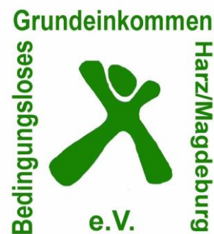
Association Unconditional Basic Income Harz/Magdeburg, Germany