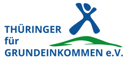
Thuringian for Basic Income, Germany