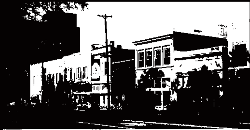
How a Guaranteed Income Could Relieve the 'Pressure Cooker' of Po... In December, a group of low-income mothers in Mississippi will begin receiving $1,000 a month in a pilot program. https://www.4mat.org