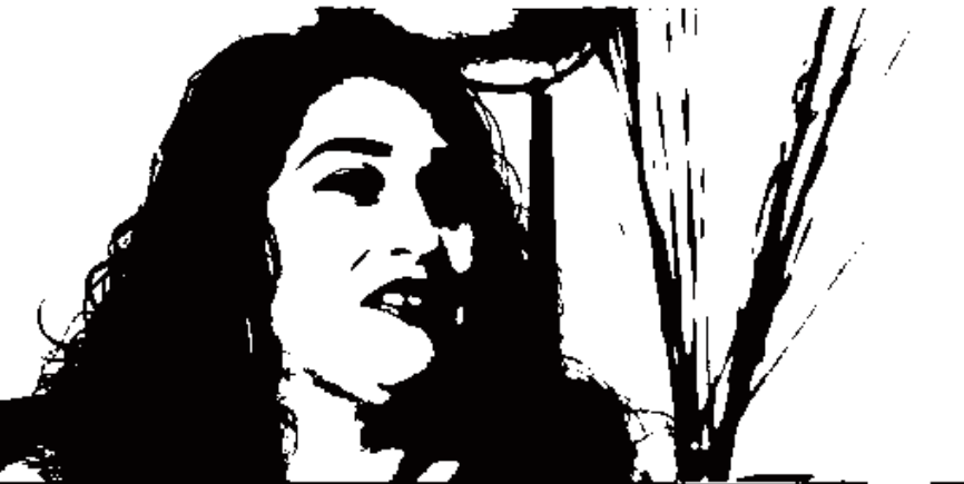
GUARANTEED INCOME PROGRAM

Stockton woman says guaranteed income program has been life-changing kcrn.com/article/stockt..