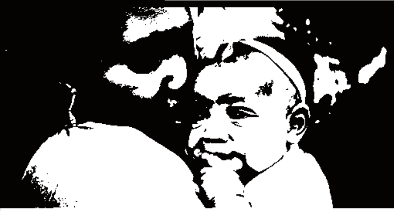
Fifteen black moms to receive $1,000 monthly in basic income experi... The pilot program is one of many other basic income experiments that have been conducted around the world to help black mothers. https://www.4mat.org